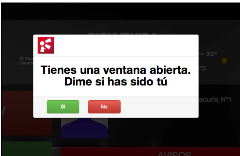
Fig. 5. Alert

The obtained results with the system have shown that integration with older people has been completely successful. The use of colors when associating with the actions of the menus has allowed a very steep learning curve, and the combination of red button with the option to back the more easily accepted. On the other hand, access of older people to the possibility of requesting services instantly without the need of relying on a phone has enabled them to increase their sense of individualism and independence. The system of reminders for taking medication or transportation schedules doctor's appointment and avoid the need to constantly check the schedules, managing largely dispel the feeling of anxiety.