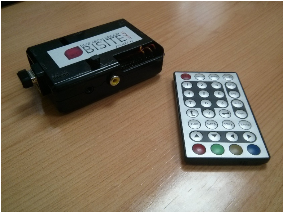
Fig. 3. Raspberry PI model B

The local exchange is a low cost computer and very low power consumption, so it just means a significant investment and saving the high costs of ongoing care of an elderly person. This unit only requires a power internet access and an HDMI connection to the TV (Fig. 3).