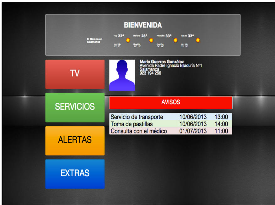
Fig. 4. Main screen

If the TV does not have HDMI connection, the system carries an infrared receiver that will map the remote control codes, so it can also be used without the need to incorporate additional control.