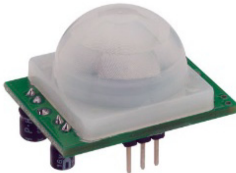
Fig. 2. Presence sensor PIR

PIR sensors (Fig. 2) allow greater battery saving since only consumed when detected emitted radiation by the human body, which activates the sensor circuit, consuming power only in that moment.