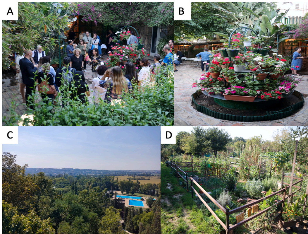
Fig. 2. Examples of green spaces in both cities. A) Traditional “patio” or courtyard in Córdoba (Spain): People use these spaces as social hubs. B) Using floral plants in pots is typical of patios in Córdoba (Spain). C) View of the green landscape in Nitra (Slovakia). D) Allotments in Hidepark, Nitra (Slovakia).

18 or older) consented to participate in the study. Data collection occurred in November 2021. Questionnaires were offered in the native language of each location (Spanish for Córdoba, and Slovak for Nitra). Since the questionnaires were utilized in a broader study, they encompassed various topics such as demographics, interactions with animals, perceptions of green spaces and public areas within the city, behavioural shifts during the COVID-19 pandemic, and social cohesion. The questionnaires comprised 63 questions, organized into five sections. However, for the purposes of this study, we selectively extracted variables pertinent to our research questions, which included sociodemographic information (age, gender, highest educational attainment, and employment status), as well as measures of mental well-being, mental health, and perceptions of green spaces.