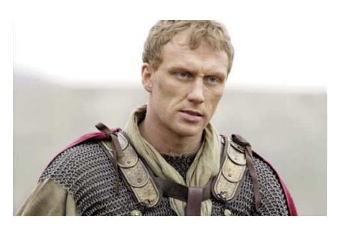
Figure 3. Lucius Vorenus.

The Honour and Pride of Lucius Vorenus (Figure 3).