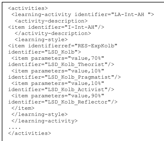
Figure 3. Learning style definition of an activity

Figure 3 shows an example of the definition of the learning activity “Introduction to AH”. Its learning style is defined following the Kolb’s Theory as 70% theorist, 10% pragmatist, 10% activist, and 90% reflector.