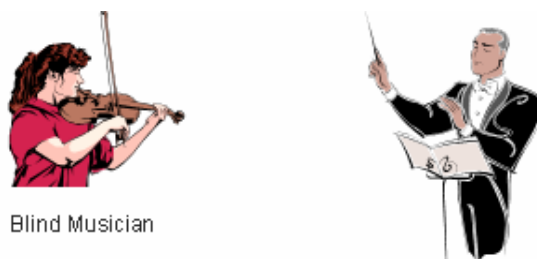
Fig. 1. Blind musician in and orchestra

After conducting interviews with various blind musicians and orchestra conductors, different conclusions were obtained. First of all, it is necessary to develop a new code that allows the association of the signals corresponding to each of the movements with electrical signals that will be transformed into vibrations. The task was complicated, but solvable taking into account certain common patterns of behaviour. Specifically, the signals for each of the movements of the conductor (up, down, ticks, and the intensity-crescendos-decrescendos) must be clear and distinguishable from each other. In principle, the speed signal which provides the conductor may have minor difficulties for coding, like the signs of intensity, but it is more difficult to encode the intermediate points. This type of problem can be solved using accelerometers or dynamometers. In our case we consider it appropriate to use the WiiMote system [9]. Furthermore, the options considered for the receiver have been armbands and headphones, the option of taking precedence bracelets (or similar) located in the chest or back, depending on the instrument that the musician plays, trying to find locations where the vibrations don't affect the normal activity of the musician. Conductor's