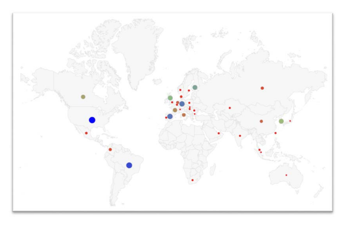
Figure 2. Publications according to the country.

From the 168 articles, the countries that had the greatest number of publications were: United States (18), Brazil (15), Germany (13), Spain (13), Finland (11) and the United Kingdom (10). Figure 2 shows the geographical distribution, where the size of the circles graphically indicates the number of publications that each country has generated.