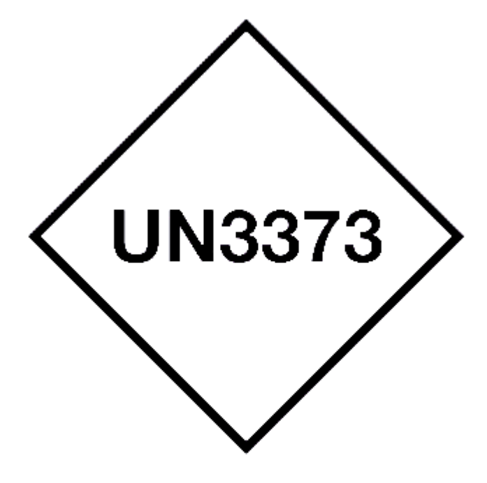
BIOLOGICAL SUBSTANCE CATEGORY B