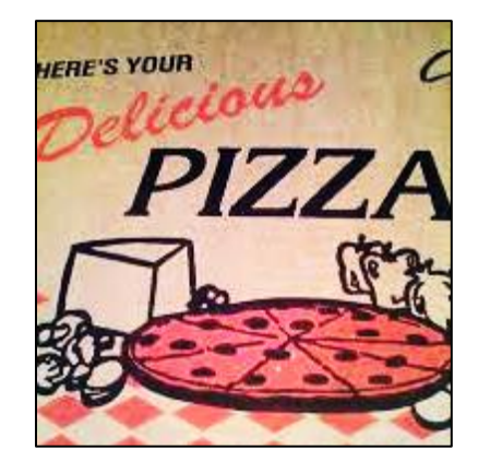
Figure 2. Example of reader-in-the-text in an advertisement

buy the products. They define projected roles as those "assigned by the … writer by means of the overt labelling of the two participants involved in the language event" (p. 108). In the case of the advertisements examined in their study, most of the time, the projected role of a reader clearly happens with the use of pronouns I , you , and we , as exemplified in Figure 2.