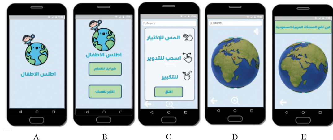
Figure 1: high fidelity prototype A) First screen shows the logo and name of application; B) Home screen contain learning button and quiz button C) Instruction screen D) 3D world map E) Quiz screen.

The low fidelity prototype design illustrated in Figure 1, is a simplified representation of the product and design concepts. It is the basis from which the design ideas are transformed into testable and tangible things. Such a prototype enables the user’s requirements to be collected and analyzed early on in the project’s development (Tiong et al., 2018).