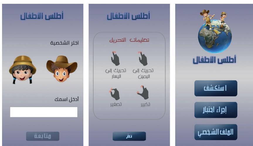
Figure 3: Interfaces of Kids Atlas.

The result of this project is a geographical application that assists children in learning geography. The interfaces are shown in Figure 3.