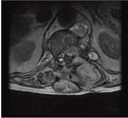
Figure 3. Transverse section MRI shows a paravertebral mass with destruction of T11, intraspinal invasion, and medullary compression.