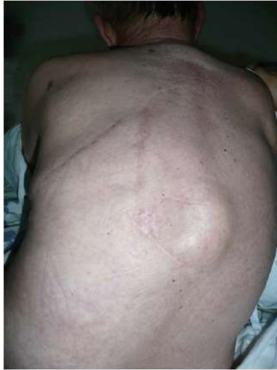
Figure 1. On examination, a fluctuant mass (6 × 6 cm) was observed on the back of the patient.

A 74-year-old man presented with paraparesis and a painful mass on his back of 4 weeks duration. He had been operated on for thoracic and vertebral hydatidosis (T10–L1 levels) 5 years previously, and had been treated with albendazole and praziquantel for 1 year with a full recovery. Physical examination revealed post-surgery scars and a new dorsal mass (6 × 6 cm) (Figure 1), paraplegia, paresthesia with no sensitive level, and decreased anal sphincter tone. Laboratory data showed elevated C-reactive protein (26.1 mg/l). The white cell count was 12.4 \times 10^9/l without eosinophilia. Serologic tests for hydatid disease had increased. Magnetic resonance imaging of the dorsal and lumbar spine showed a paravertebral mass with destruction of T11, intraspinal invasion, and medullary compression (Figures 2 and 3). The final diagnosis was recurrent spinal echinococcosis with medullary involvement. He was rejected for surgery due to secondary complications. He received medical treatment (antiparasitic drugs and steroids) with little clinical improvement and finally died due to urinary sepsis.