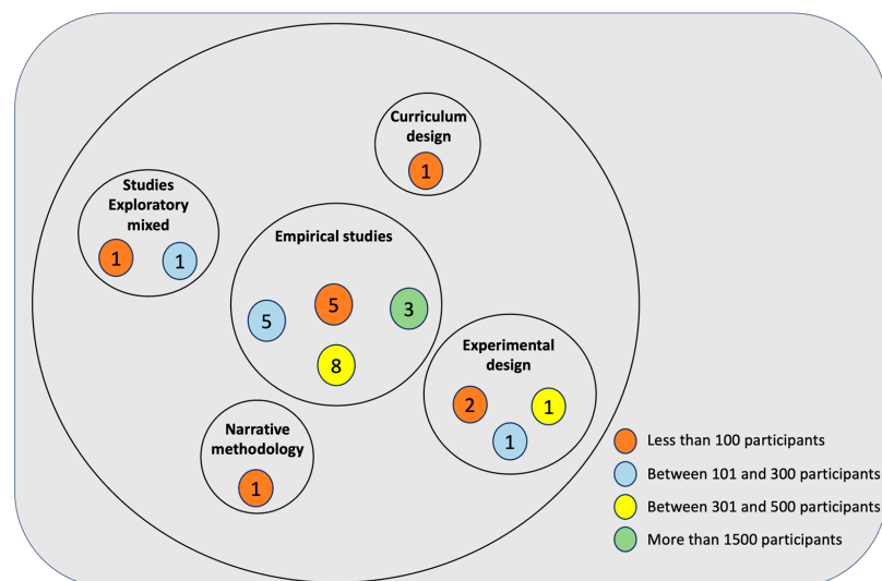
Figure 2. Distribution and number of articles by research methodology and sample size.

Only 4 studies do not refer to the use of samples. In relation to the others, the most frequent are those using less than 100 participants (30.3%), followed by those studies with samples of between 300 and 1500 subjects (27.3%). In third place are those with a sample size between 101 and 300 participants (21.2%), and at the end are those using more than 1500 subjects (9.1%). Figure 2 summarises the methodologies used and the sample size.