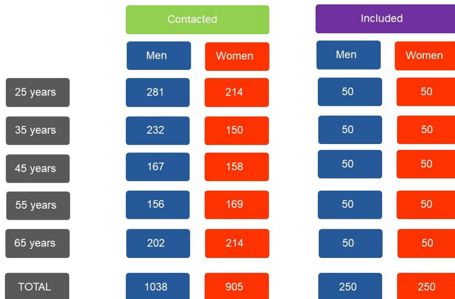
Figure 1 Individuals contacted and included in the study, segmented by age groups and sex.

complete the established sample size. The data segmented by age group and sex are shown in figure 1 . The participants were not integrated into the project design.