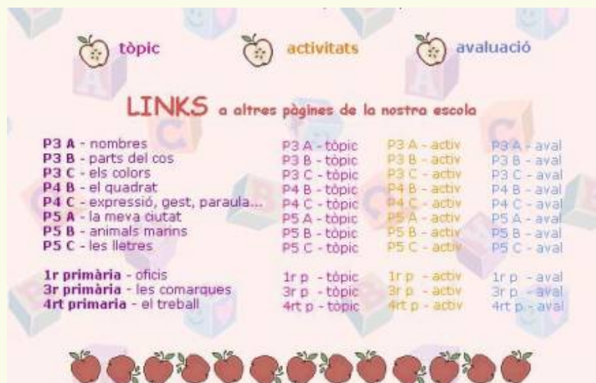
Fig. 1. Introduction to Fruit

The means for linking the 12 websites was another technological medium—email. During the course, each group had its own email address. At a large group meeting it was agreed that each group would email their website address to the other 11 groups to be included in the Introduction portion of their own coherent website. This meant that anyone could connect with the work of the other groups. Fig.1 shows the Introduction (the title of the introduction and the names and pictures of the individuals of the group have been edited out to maintain anonymity) of a group's website on fruit. At the top of Fig.1 are the other sites (topics, activities, evaluation) of this website. Below that is "LINKS a altres pàgines de la nostra escola" (Links to other pages in our school). As can be seen in the figure, each of the other websites is linked according to its ITAE.