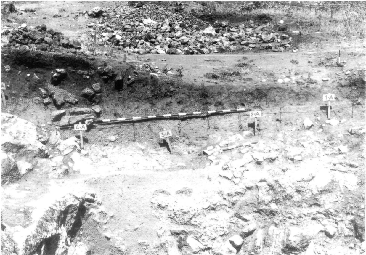
FIG. 3. General view of north profile.

area were without concluding. Fortunately, the relatives of Ruiz Argilés have allowed access to the authors of the present paper to a rich collection of photographs and documents on this section of the cavity (Figure 3). Later field works undertaken in this outcrop affected other points of the cavity (Municio & Piñón, 1991), thus the interest by the entrance area being abandoned.