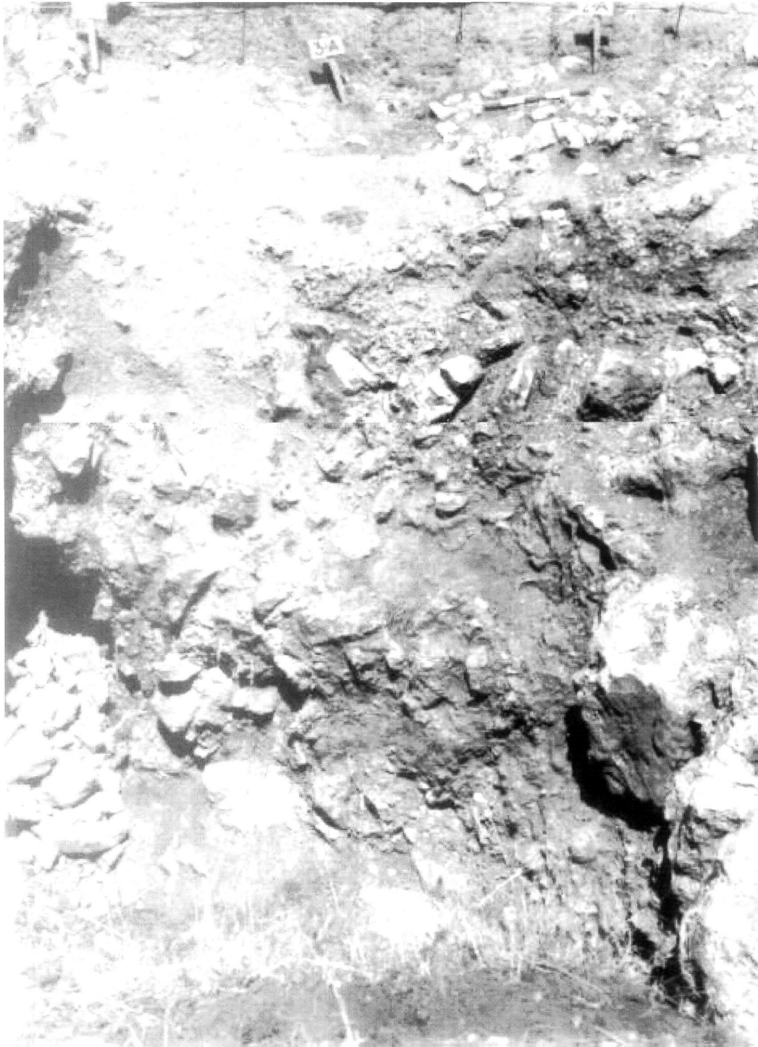
FIG. 4. View of the lower unit of north profile.