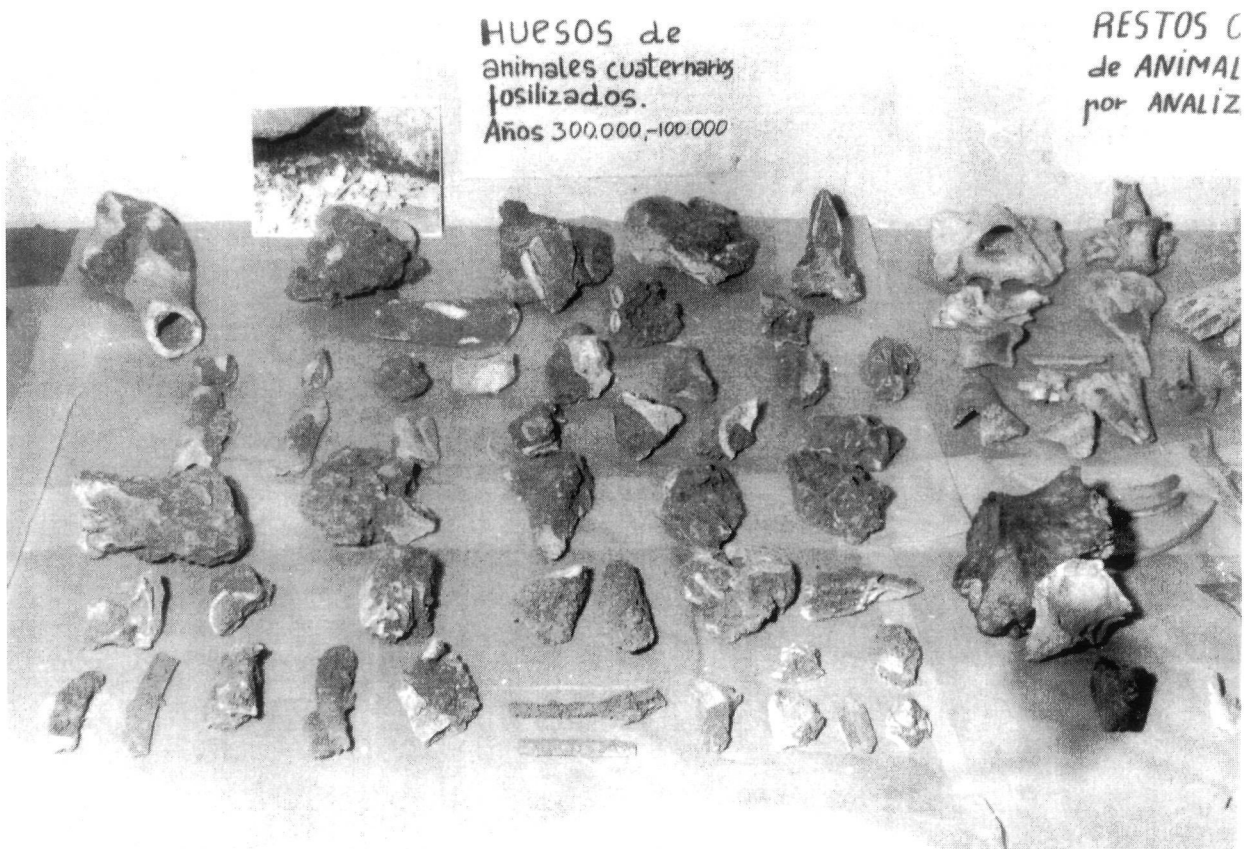
FIG. 2. Historical picture of faunal remains from the area of the entrance to the cavity.

One disease in 1974 obliged Ruiz Argilés to leave the practice of archaeology (Ruiz and Ruiz, 1988), reason why the works in this