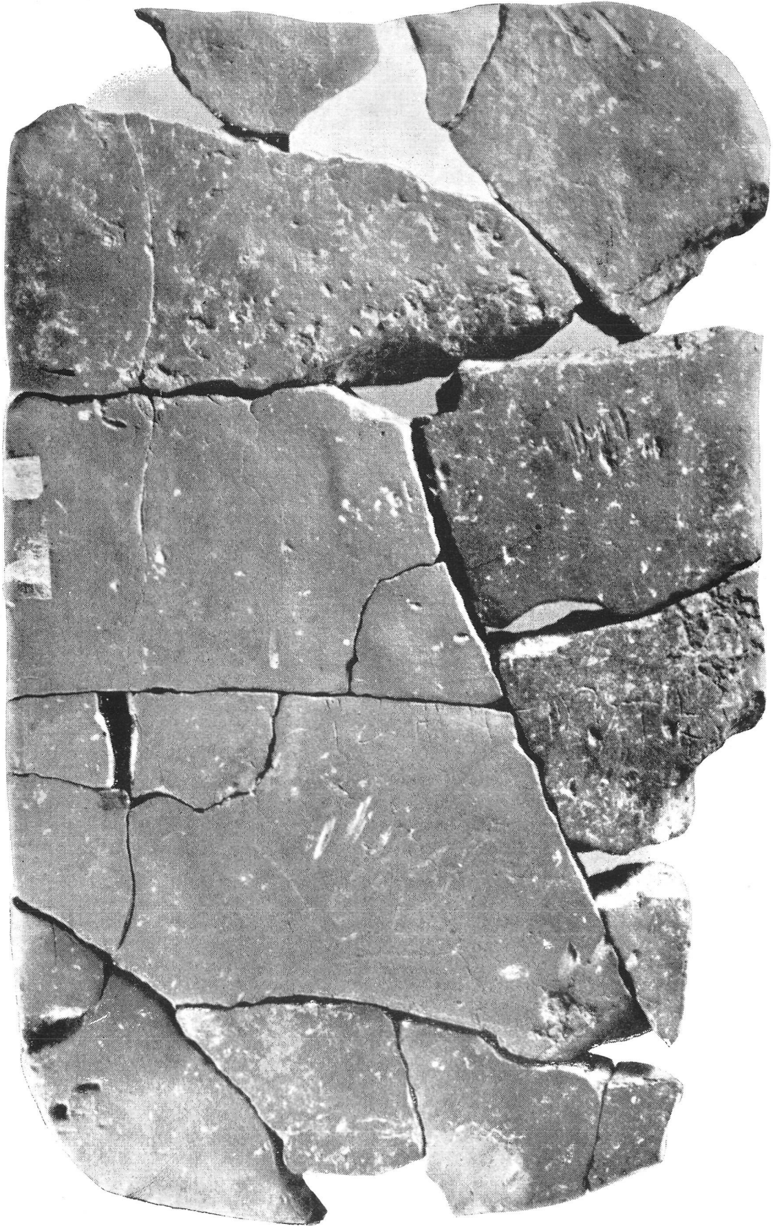
PY 218 reverse.