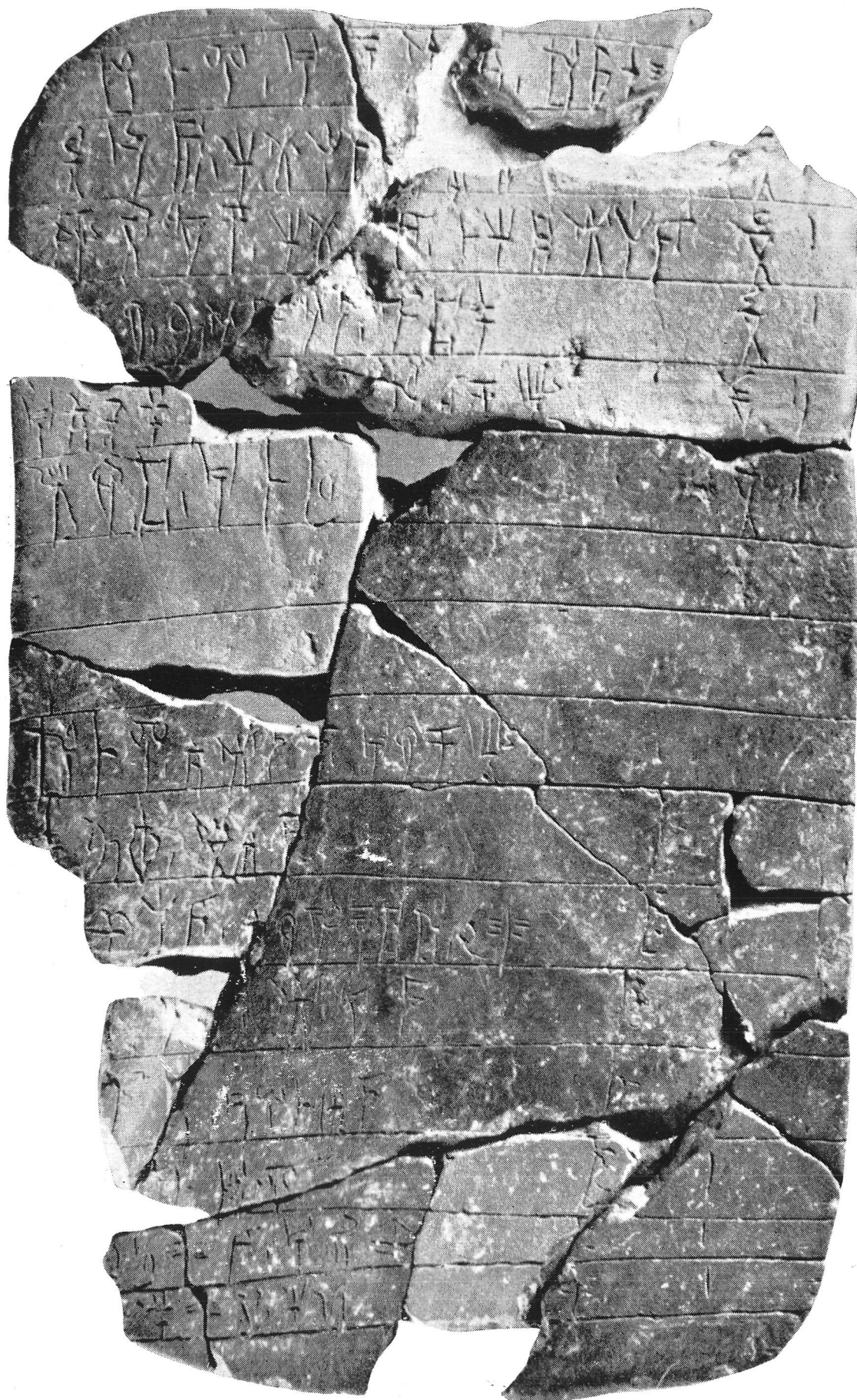
PY. 218 obverse.