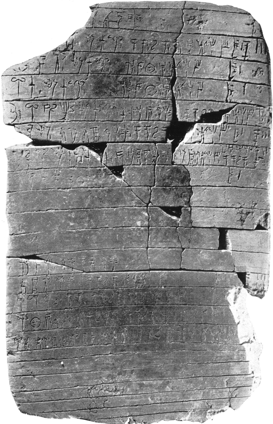
PY 64 obverse.