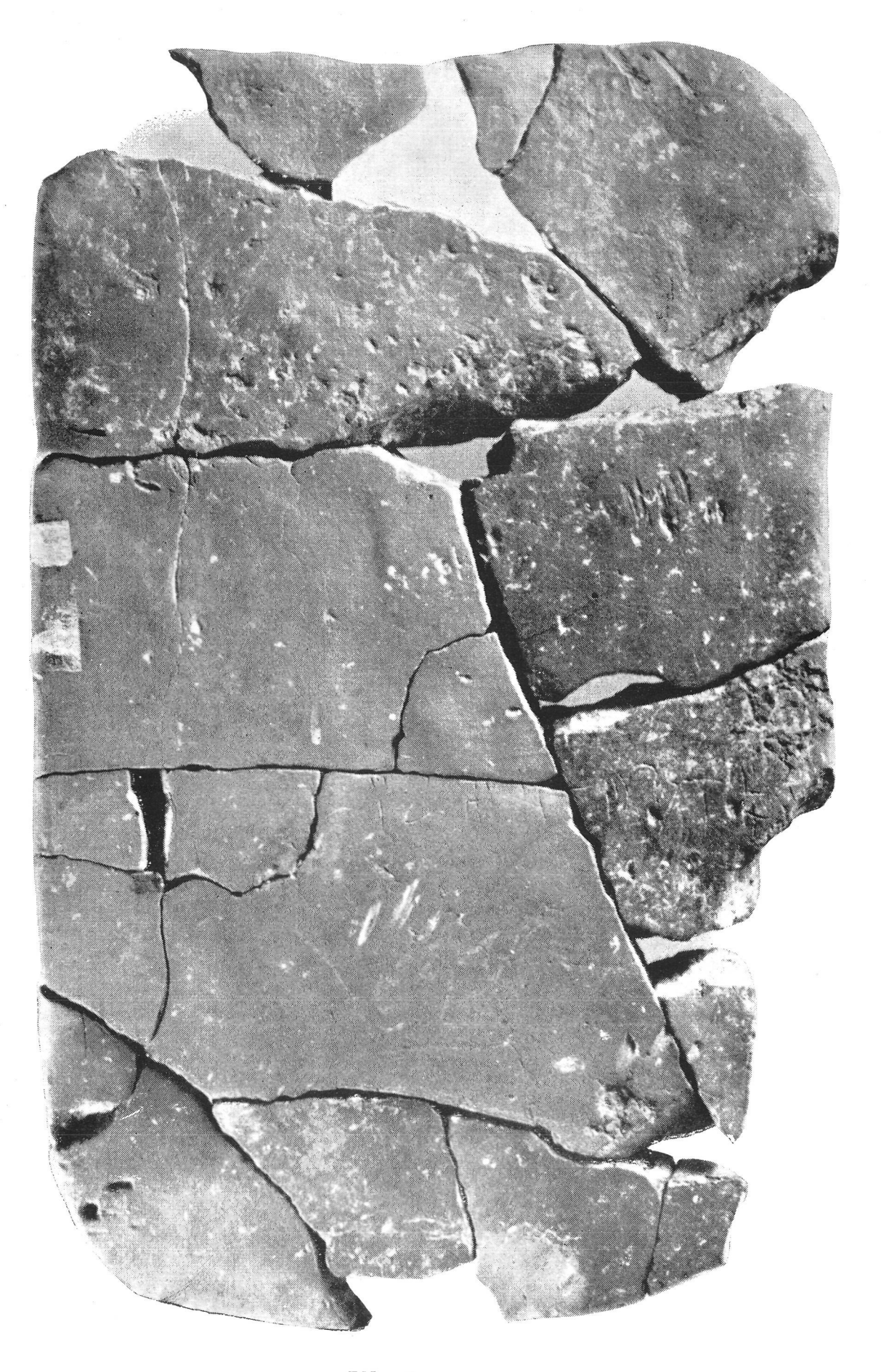
PY 218 reverse.