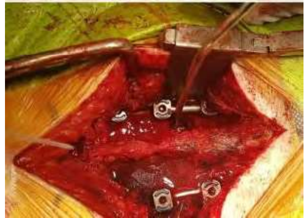
Figure 7: Virtual and real image of screws and bar in its final position