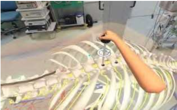
Figure 6: User using self-holding screw