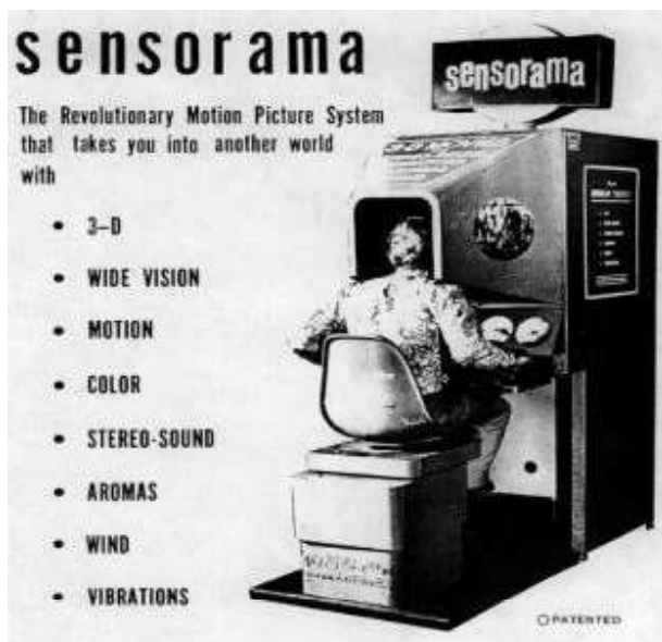
Figure 1: Advertisement for Heilig's Sensorama, courtesy of Scott Fisher's Telepresence

created his now well-known Sensorama machine. This machine (Fig. 1) was able to show stereoscopic images in three dimensions with a high quality stereo sound, even reproducing the wind sensation and certain aromas, with the aim of creating a dive as realistic as possible in the virtual world that showed. This revolutionary machine was used to reproduce films in three dimensions. Today we have taken the concept of Virtual Reality much further, including real applications, that a few years ago would have been considered futuristic and distant.