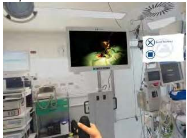
Figure 8: Visualizing video of real surgery in the monitor

In the first case, the system teaches the user what to remove the retrosomatic musculature, which includes the emigrated musculature and own musculature, each formed by its own muscles. Then these muscles are hidden and a video of a real surgery is shown for the user to see how the first step should be carried out: the use of the punch. The videos are projected on a television set inside the operating