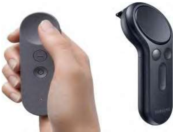
Figure 3: Daydream and Gear VR controllers

We have used the 3D model of a complete human body (Fig. 4), including musculature, skeleton, ligaments, arteries, veins, etc. This supposes a more complete view of the patient and its interior, although also requires a greater amount of memory in the Device on which the software is to be run.