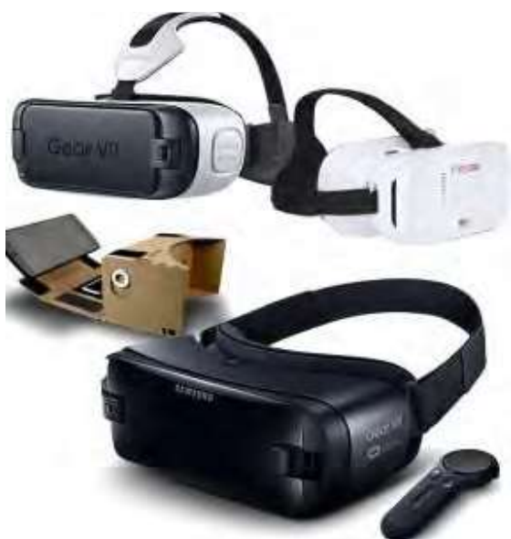
Figure 2: Virtual reality glasses used in the study

However, more important than the hardware used are the tools that allowed us to design and implement this system. In this regard, it is worth noting the use of the Unity3D video game engine. Although this software was initially designed for video game design, the truth is that its great versatility has been used for many other purposes, one of them is the development of Virtual Reality systems.