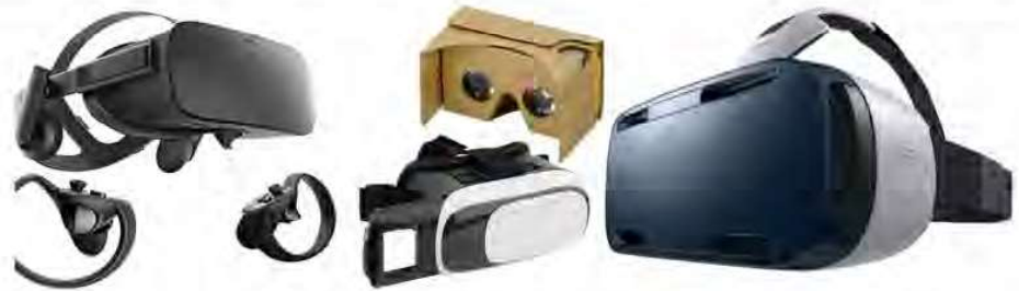
Fig. 1 Some of VR Google used for the development of our systems

virtual simulations also have their advantages over training and training with real patients.