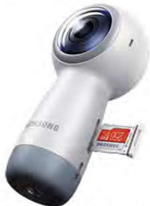
Fig. 2 Samsung Gear 360 camera 2017 edition used for capturing 360 images and videos

This program is divided by two different scenes or modules. In the first scene we have a 360 image of an operating room, and we have placed virtual elements near the different machines we can find in an operating room. These virtual elements reacts when the user looks at them, so when the user