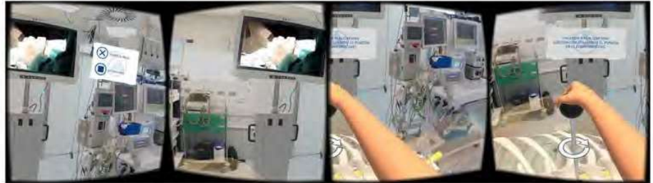
Fig. 4 First step of the interactive simulation visualizing a real video of this step

steps selected were as follows: i) use the punch or estefi's ball to work the way for the screw through the pedicle, ii) attach the screw to the screw locker, iii) fastening the screw through the path previously worked, iv) release the screw, leaving the screw in the polyaxial position, v) repeat steps 1 to 4 for the different screws to be placed, vi) capturing of the bar with the clip holder, vii) fastening the bar onto the screws, viii) attach the closure cap to the holder, ix) fixing the plug on the screw to fix the rod and x) release the cap.