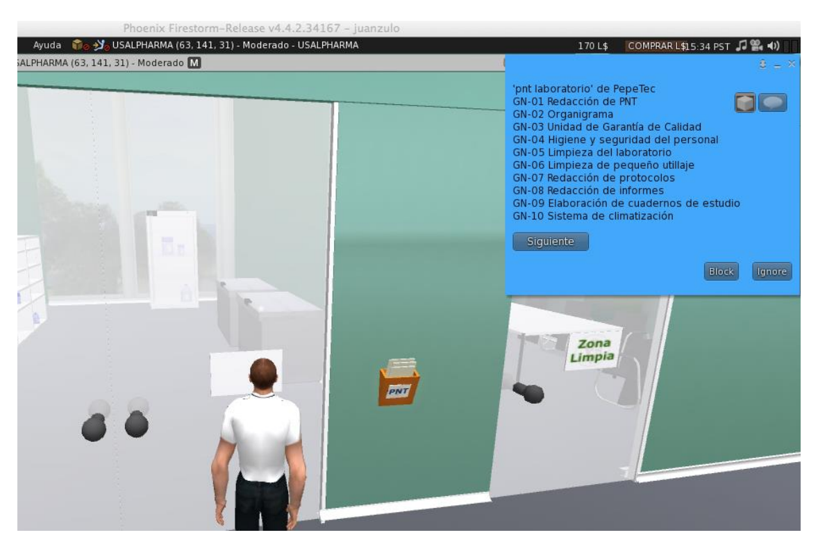
Figure 2. Example of dialog box in Second Life

As previously mentioned, the first question on how to describe the evidence of learning or training, can be answered through the use of a standard method for description. In the case presented, the use of RDF resource description standard can suit, modifying it in such a way that fulfills the purpose of describing user-interaction virtual environment. modification or adaptation includes information about the user performing the action, which takes concrete action (touching, sitting, etc.), which object get the action, the time at the action is performed (time stamp), as well as other information on the virtual location where the action was performed (the laboratory, or any particular room inside it if necessary to specify). Thus, the analytics framework could use a rich data for better and powerful analysis [8], as another approaches to analysis of learning activity streams pose [9] [10] [11].