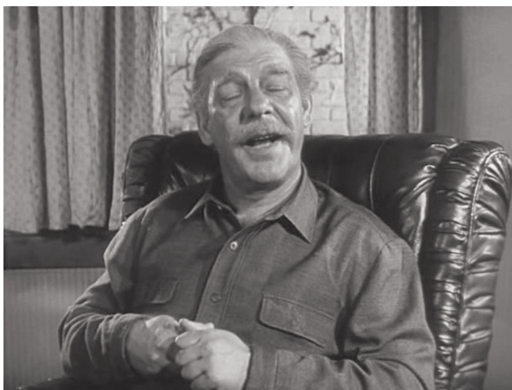
Deformity and ankylosis of the joints.