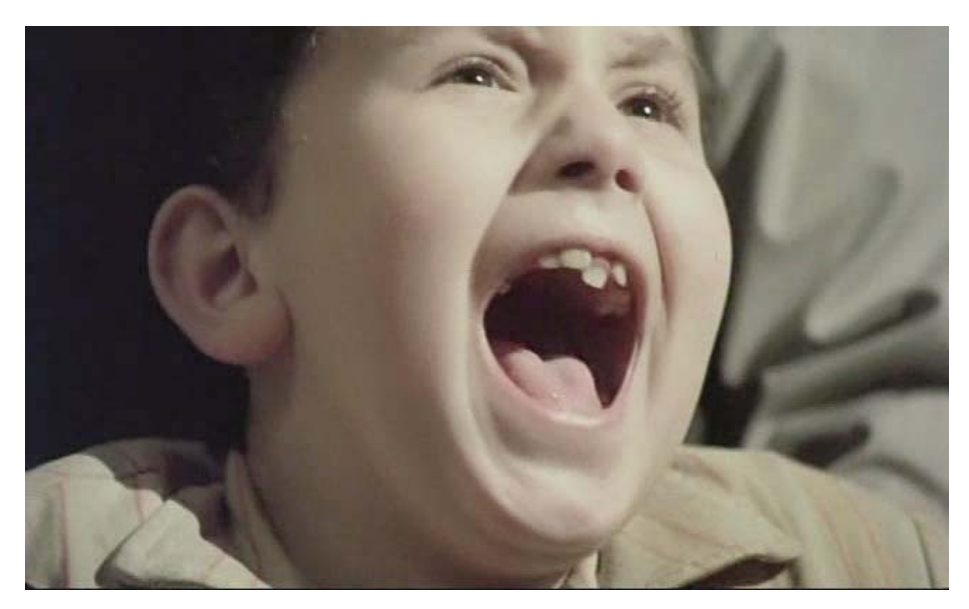
Painful grimace on boy's face considering no local anesthesia was used.