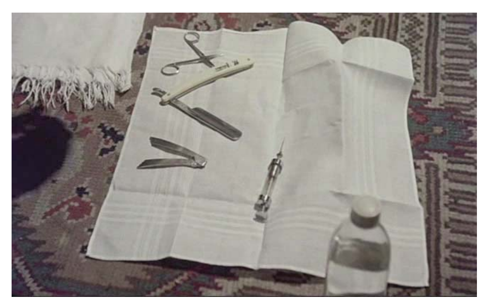
Circumcision set on the floor.