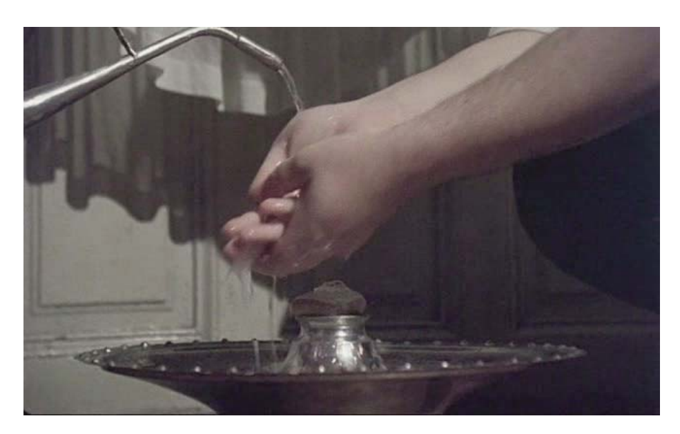
Hand-washing before the procedure.