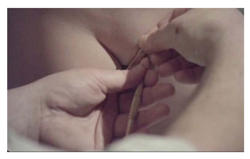
Placement of a forceps so that skin along its outside edge can be cut.