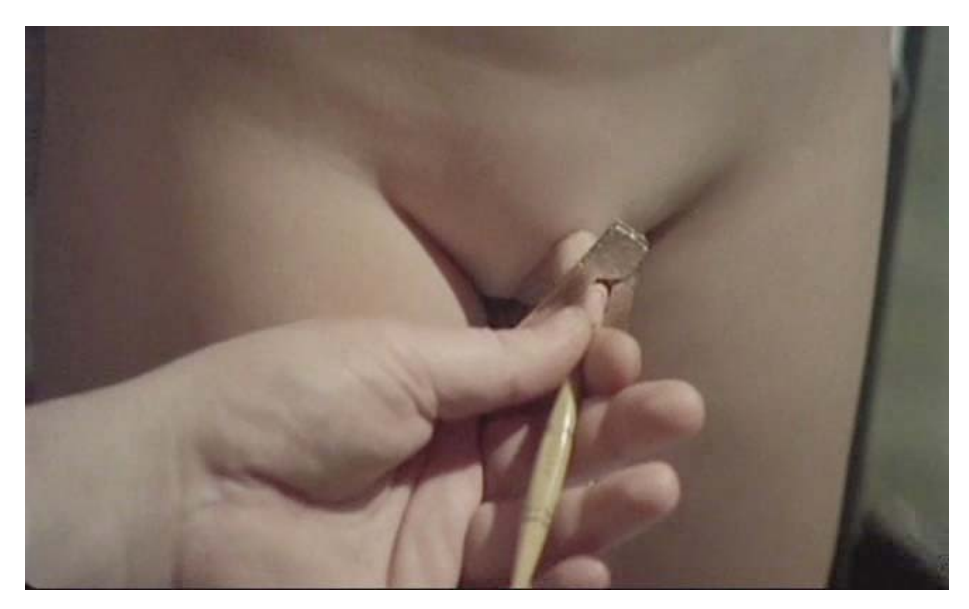
Forceps in place enabling guidance of the incision and protection of the penis from injury.