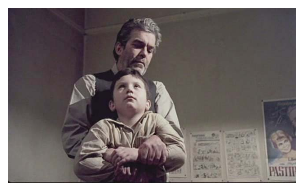
The boy is held tightly to prevent any sudden movements.