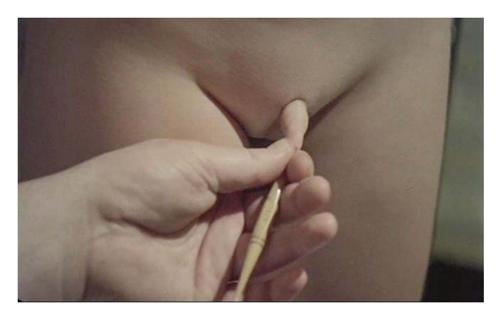
Foreskin is fixated and pulled forward over the head of the penis.