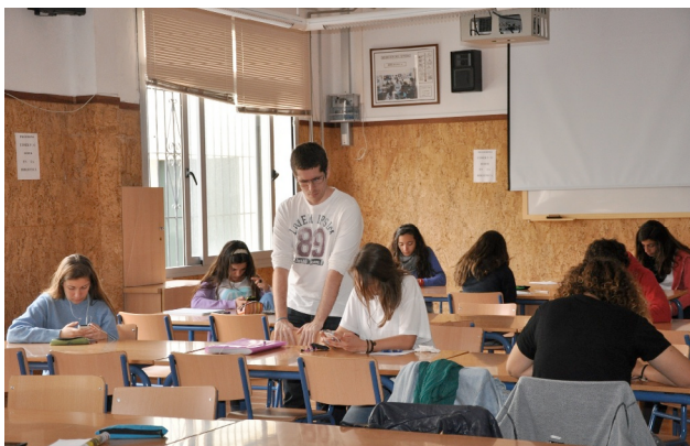
Figure 5. VocabTRAINER A1 workshop

There are other ongoing training activities in ODS schools, including the use of gamified mobile environments for foreign language learning and video game computer programming. The two Android applications used for this kind of training activities in schools are: VocabTRAINER A1 (see Figure 5) and Guess it! Language Trainer.