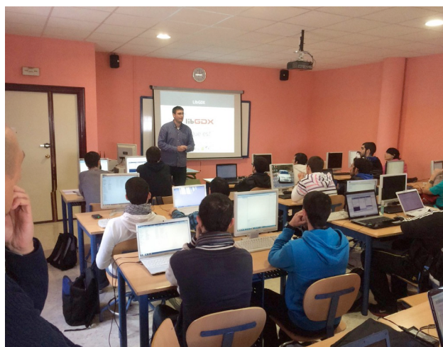
Figure 4. LibGDX workshop

A number of workshops and training activities have been organised in ODS, mostly around game-based learning approaches and open source tools. They all aim to pursue an increasing use of ICT at primary and secondary schools, including the following features: the spread of advanced assessment instruments (e.g. EvalComix) as well as the development and use of open game-based computing environments (e.g. e-Adventure and OpenSim). This is done either by using augmented reality tools for learning (e.g. Aurasma) or by creating OER contents with authoring tools (e.g. eXeLearning) and developing games and interactive stories (e.g. Scratch). One of these workshops is illustrated in Figure 4, which shows a workshop on developing games using Java and LibGDX.