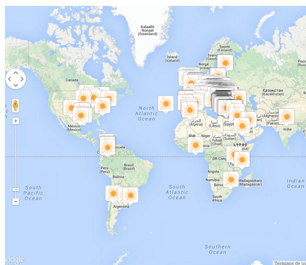
Figure 9. Participating schools in Eratosthenes experiment

order to participate in a photo contest.