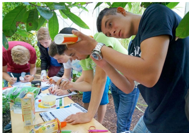
Figure 8. Students exploring daily products and their tropical origin

during a DFG project (Figures 7 and 8). The idea was to explore realistic scientific problems by themselves. This project was tested and analysed for students' quality perception and learning outcomes when using the eLearning module (Bissinger, & Bogner, 2015) revealing knowledge acquisition and a high quality perception.