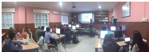
Figure 2. Original ODS Innovation Model (Sotiriou et al., 2012)

Therefore visionary workshops took place in the first year of the project familiarising schools' teaching staff first with already existing and available resources on the Web and then with the forthcoming ODS infrastructure. The goal of these events was to engage participants around both national as well as subject-focused communities. Additionally, the mission of teachers as change-agents in ODS is introduced through so called change-agent workshops. These aim to discuss obstacles, types of resistance as well as ways to tackle them. Finally, a number of practice reflection workshops (see Figure 3) were held. The latter intended to first present the different educational activities and resources, that were developed during the project, and then to discuss their impact on students learning.