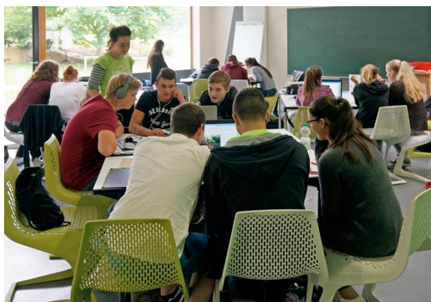
Figure 7. Students engaging in the digital learning scenario

garden (either the University Bayreuth or the Johannes Gutenberg University Mainz). In this informal learning environment they followed an inquiry based approach to learn about the tropical ecosystem and strategies for plant adaptations regarding the climatic conditions in tropical rainforests. In this context the anthropogenic influence concerning the ecosystem was reflected. Possibilities for actions in student's daily life -concerning a sustainable development in the sense of social responsibility were explored. Therefore the project was awarded a contribution to the UN-Decade for sustainable development. A complementing eLearning module (available through the ODS platform - http://portal.opendiscoveryspace.eu/de/node/669570 ) provided a real-life window to a research centre in the tropical rainforest of Ecuador. The students gained insight into the daily life and research of "real" scientists. Thereby students had the unique opportunity to work with original data, which were collected