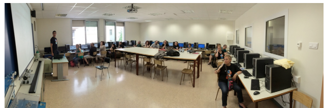
Figure 6. Collaborative work and evaluation through a wiki workshop

course participants. Those projects, which were selected by the organisers, were later on presented by each author to the rest of the course. The activities were presented under the category “Learning by doing”. Three of these activities were conducted by several ODS team members in aulaBLOG 2014, concretely: “Open Educational Resources”, “collaborative work and evaluation through wikis” and, “Aumentaty”. Figure 6 shows a picture of the collaborative work and evaluation through a wiki workshop.