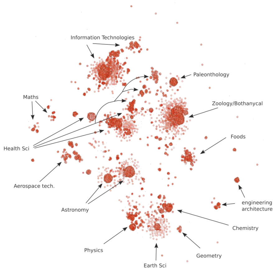
Figure 2. The communities of Wikipedia articles based on the analysis of weblinks

As can be seen in graph 2 the communities of articles based on the analysis indicates a relative traditional division of scientific contents.