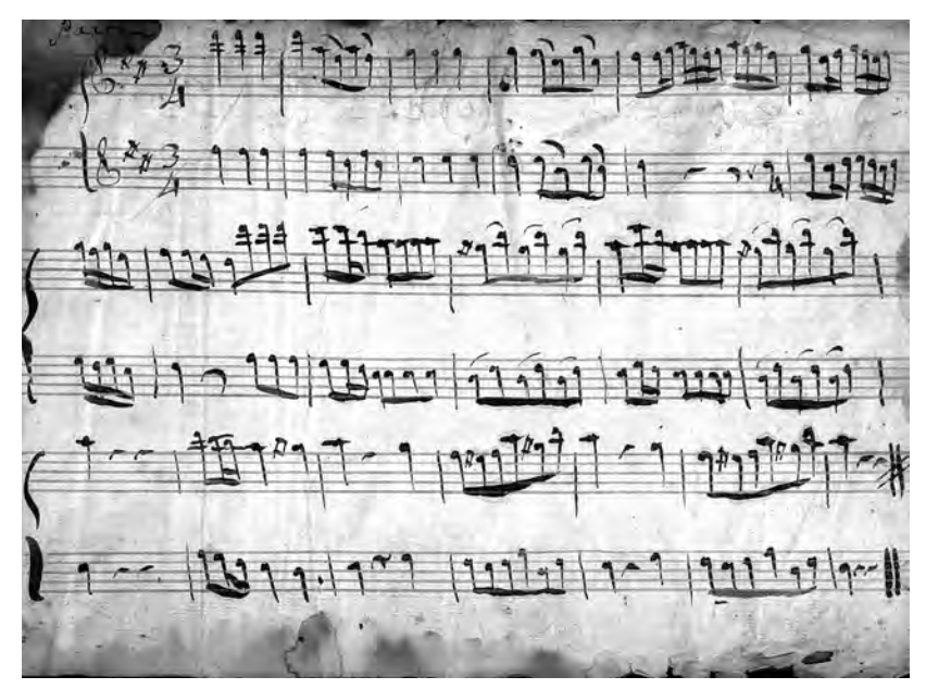
Figure. 3.1. Book of dances for one or two violins (last page with music, without numbering). E-Mn MC/4824/2.

Doce contradanzas nuevas was issued in Madrid in 1775 and advertised in the local press the following year (GM, 9 January 1776). No doubt, it can be related to the fancy-dress balls that were fashionable in Spain from the 1760s, which generated a series of related publications containing explanations of the dance steps, simplified choreographic diagrams and musical examples.<sup>72</sup> These public events were held in large rooms such as the Coliseo del Príncipe in Madrid, where a numerous orchestra was needed (as Luis Paret's painting Baile en máscara , dated ca. 1767, depicts).<sup>73</sup> In fact, the edition related to the 1768 Carnival ball held in Barcelona theatre informs that two orchestras took part then. The first orchestra included fourteen violins, four basses, two "clarines" [trumpets]