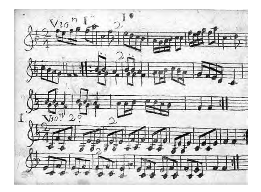
Figure 3.2. Doce contradanzas nuevas abiertas hechas para el Príncipe N. Señor, las que se baylaron en este presente año de 1775, con su música de primero, y segundo violín, y la explicación de figuras ([Madrid]: Ibarra, s.a. [ca. 1775]). Contradanza 1 (without numbering). E-Mn MC/3602/34.

M/2242, which are collective volumes of duets that come from the royal collections, bear signs of a pedagogical use.<sup>77</sup> These manuscript volumes feature four sections, each one copied on a different paper by a different hand. All four sections were presumably bound together some time in the nineteenth century, when a title page was added and the works in sections 2–4 were added to the contents page. The first section includes duets for two violins by Michel Joseph Gebauer and Giuseppe Maria Cambini<sup>78</sup> as well as arrangements, for the same scoring, of overtures from stage works